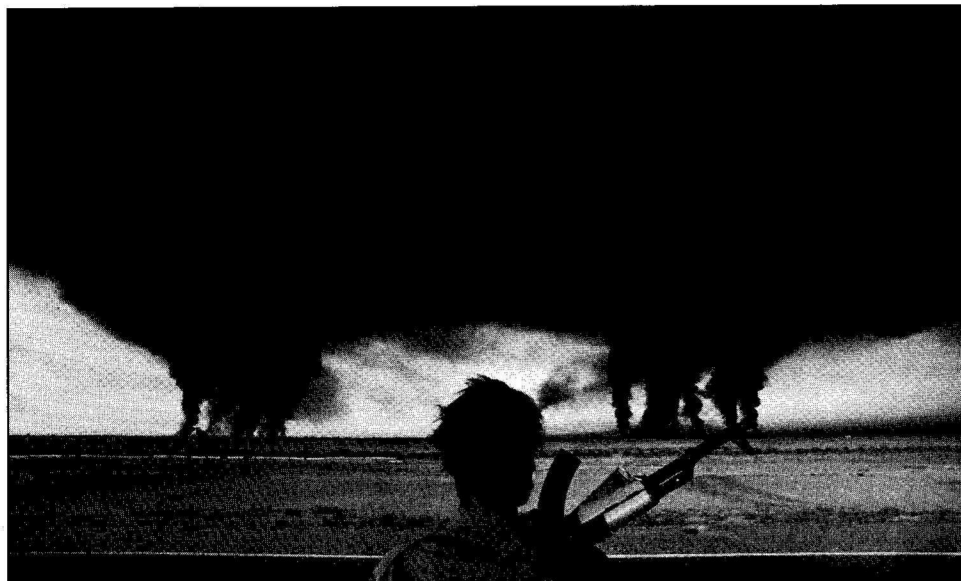
At the start of the Iran/Iraq war, Iraqi soldier watches Iranian airport after bombing