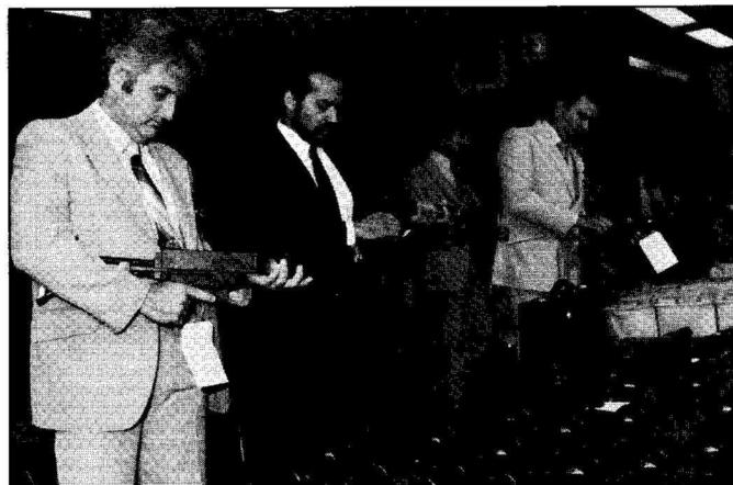
Federal agents with a cache of confiscated arms, including MAC/10 submachine guns with silencers (on table)