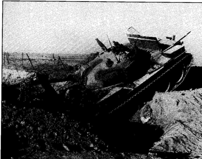
...which gets hard use in the continuing war with Iraq.

related equipment—including spare parts that could be used for both civilian and military aircraft—to Iran. So any attempts by the Iranians to buy such material from the U.S. are strictly verboten. But the Khomeini regime's agents have let it be known in the American defense industry that money is no problem for weapons dealers who are willing to risk heavy fines and long prison terms. A lengthening American court docket of Iranian arms smuggling cases indicates there are numerous enterprising individuals in the U.S. ready to accept Khomeini's cash.