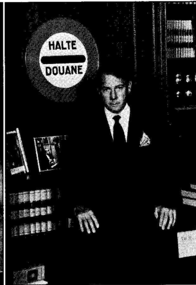
Customs commissioner von Raab